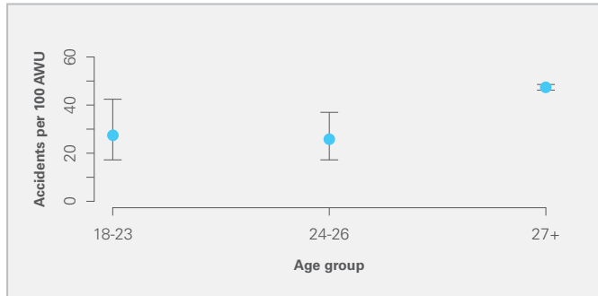
Figure 1. Expected number of accidents per 100 AWU (annual work unit). The lines represent a 95% confidence interval.