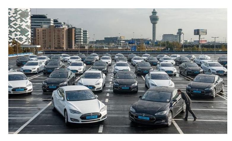
Amsterdam Schipol airport Tesla project