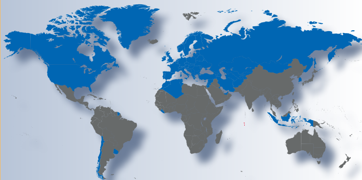
TIR Contracting Parties in 2011

The number of TIR Carnets issued every year has grown steadily over the years. With the foreseen growth of international trade volumes, the TIR System is expected to play an ever more pivotal role in promoting, further securing and facilitating trade and international road transport.